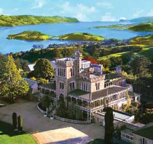
Marvel at the opulent furnishings and exquisite detailing of Larnach Castle in Dunedin.

RESPONSIBILITY: Gohagan & Company, the sponsoring associations/ organizations, and its and their employees, shareholders, subsidiaries, affiliates, officers, directors or trustees, successors, and assigns (collectively “Gohagan”), do not own or operate any entity which is to or does provide goods or services for your trip including, for example, lodging facilities, airline, vessel, or other transportation companies, guides or guide services, local ground operators, providers or organizers of optional excursions, food service or entertainment providers, etc. All such persons and entities are independent contractors. As a result, Gohagan is not liable for any negligent or willful act or failure to act of any such person or entity or of any other third party.