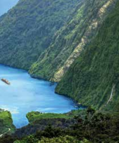
glacier-carved fiords and look for dolphins,