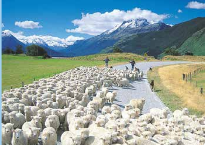
Experience the important tradition of sheep farming in New Zealand, home to over 27 million sheep, a ratio of six sheep to every person.

Dunedin Railway Station, one of the most photographed railway stations in the world. Tour historic Olveston, the philanthropic Theomin family's English country house. New Zealand's only castle, Larnach (1871), was designed in Scotland then built atop a spectacular hill overlooking Otago Harbor. Enjoy a walk through its period rooms and magnificent, award-winning gardens.