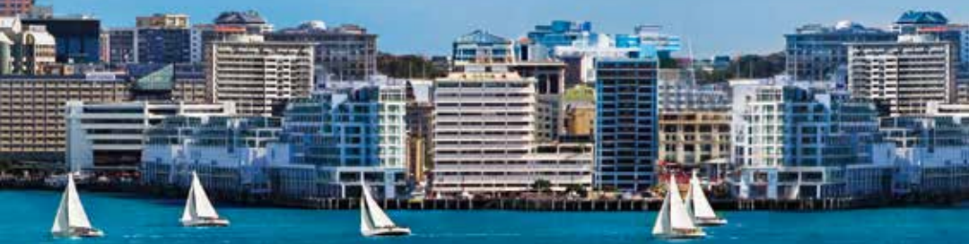
Photo this page: Explore Auckland's magnificent Waitemata Harbor, defined by the soaring Sky Tower, the tallest building in the Southern Hemisphere.