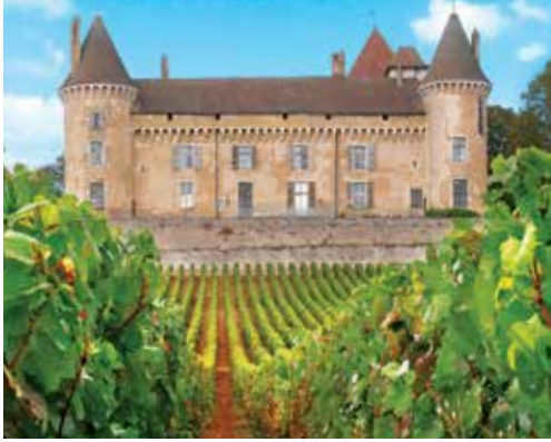
Look for rustic châteaux and verdant vineyards scattered throughout the French countryside.