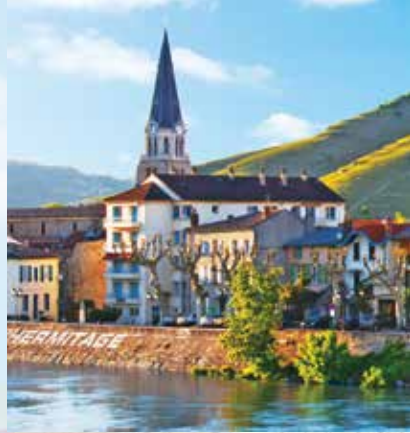
The Rhône Valley vineyards thrive on both of the most famous wines.

Located along the banks of the Saône River, this internationally acclaimed wine region has been known to produce more red wine than the Burgundy vineyards of Chablis, Côte d'Or, Côte Châlonnaise and Mâconnais combined.