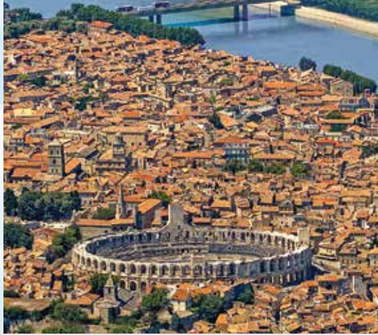
Arles' Romanesque architecture reflects its history as a vital port on the Roman road from Italy to Spain.

See the Triumphal Arch, built in the late first century in testimony to Augustus Caesar and Roman imperial glory.