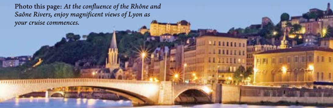
Photo this page: At the confluence of the Rhône and Saône Rivers, enjoy magnificent views of Lyon as your cruise commences.

Cover photo: Cruise past the medieval town of Tournon-sur-Rhône, surrounded by undulating, verdant vineyards.