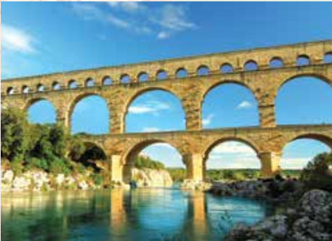
The first-century Pont du Gard aqueduct was built with 55,550 tons of soft limestone blocks.

The city's colorful houses, bathed in golden light, inspired Van Gogh, who produced over 200 works during his 14-month stay in 1888, including The Sunflowers and The Café Terrace at Night —the café on Place du Forum is still open to the public. Enjoy the afternoon at leisure.