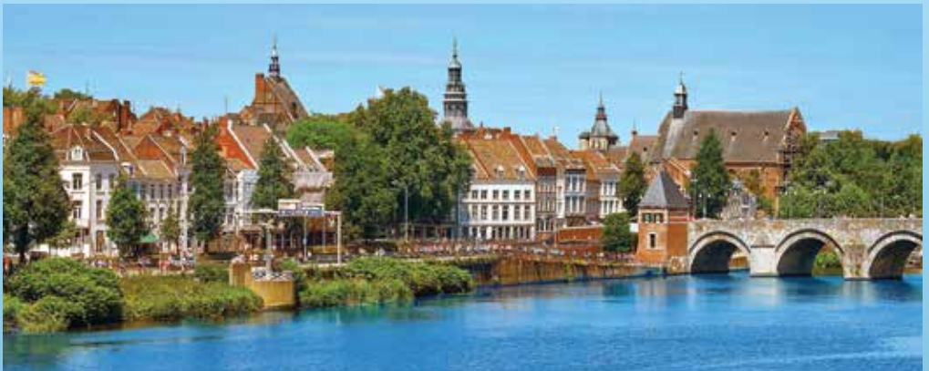
Photo below: Look out onto the storied River Meuse from the picturesque town of Maastricht.

Cover photo: Cruise through the Netherlands, where tulip blooms announce the arrival of spring.